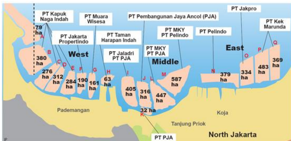
Figure 1. Jakarta Bay Reclamation Plan Map.